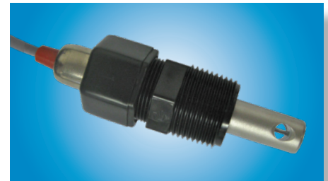
Assembled CS951 Sensor

The built-in PT1000 RTD makes accurate and quick temperature measurements for superior temperature compensation 2 .