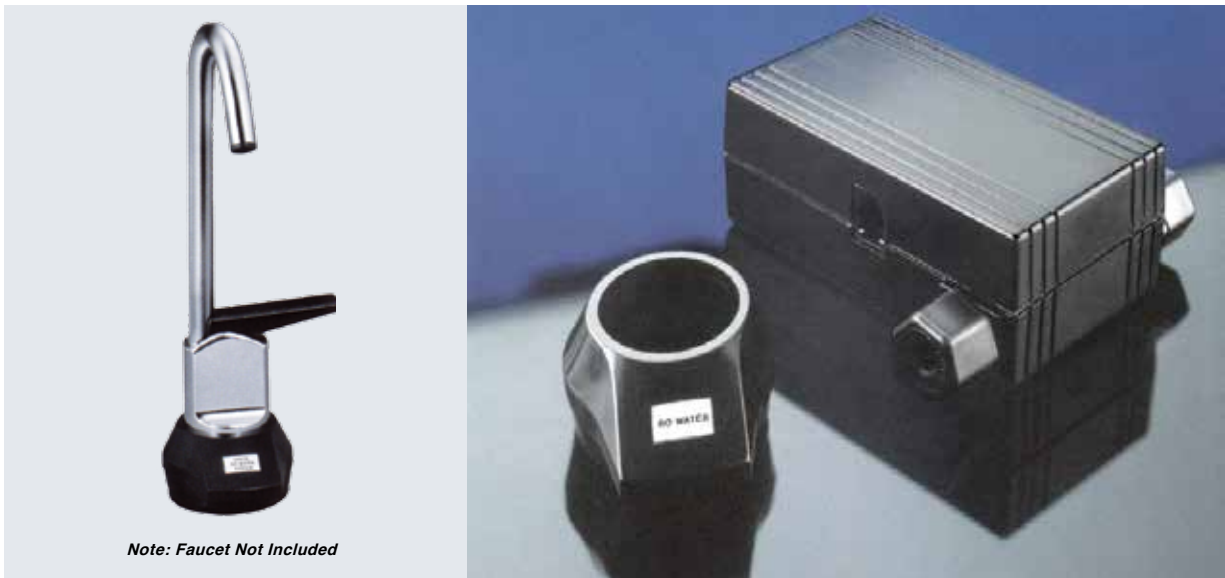
Note: Faucet Not Included