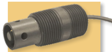
Conductivity Sensor CS50

Sensor constants 0.1 and 1.0 are available. The ranges that can be achieved with these sensors are dependent on the model and range of instrument — up to 20,000 \mu\text{S/ppm} is the normal maximum range of use.