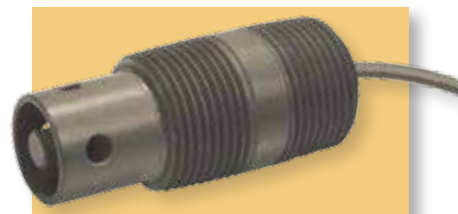
Conductivity Sensor CS50

Sensor constants 0.1 and 1.0 are available. The ranges that can be achieved with these sensors are dependent on the model and range of instrument — up to 20,000 \mu\text{S/ppm} is the normal maximum range of use.