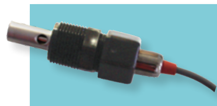
Assembled Resistivity Sensor

The CS10 was designed primarily for use in pure water applications.